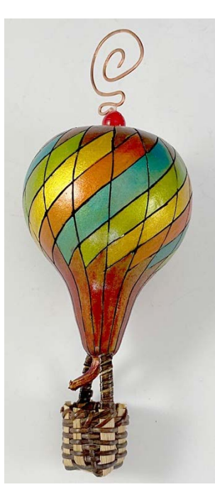
Examples of the variety of design