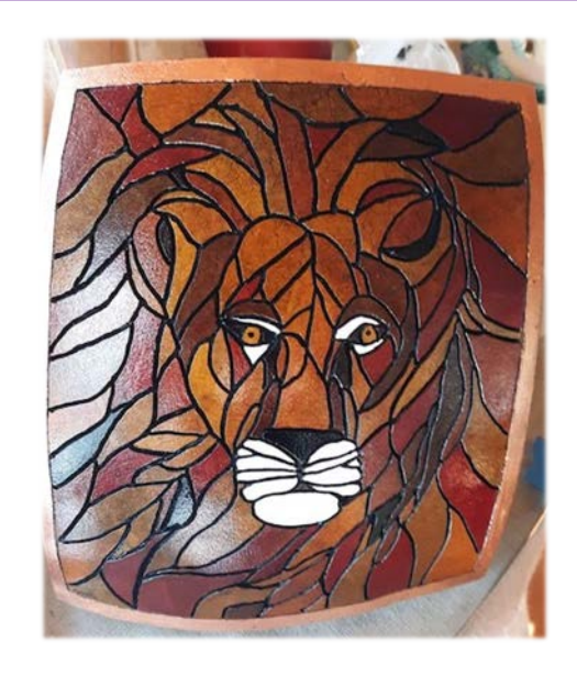
More of Iris's Beautiful work!