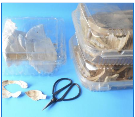
Clear plastic containers filled with gourd scrap and in foreground with scissors is a scrap of gourd lining with a flower petal cut out of it.