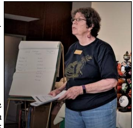
(Continued on Page 7)

Olive asked for feedback and input on what members want to see published in the Golden Gourd. Some ideas included "Feature a Member", "Gourd Sightings", "Tips & Tricks" and "Classifieds". Of course Patch news is always wanted.