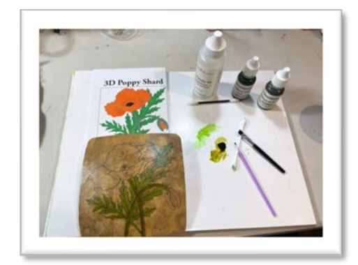
Tip: Use a little formula 49 or an acrylic medium and a micro tipped brush to clean up your edges.

Using Transparent Acrylics, paint your leaves with "Leaf", and your stems with "Nutmeg." (see sample below)