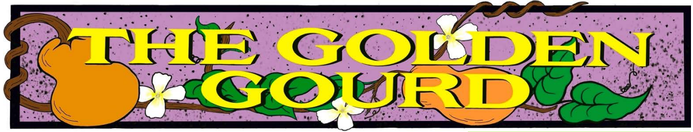
The Newsletter of the California Chapter of the American Gourd Society