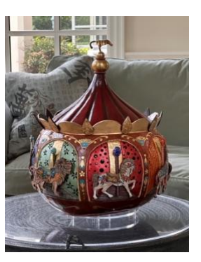
From backyard photo, too sketched concept, for a gourd I am currently working on.