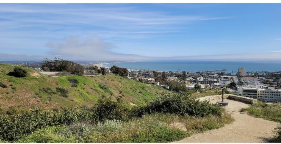
~ Continue pg. 21