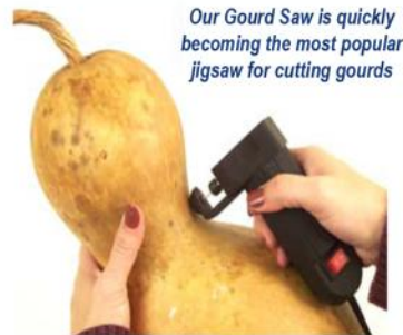
Our Gourd Saw is quickly becoming the most popular jigsaw for cutting gourds

Featuring the only power tools designed expressly for gourds!