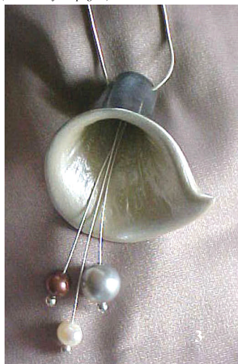
Fig. 3) is my first attempt at creating gourd jewelry.

There are limitless possibilities waiting for me as I travel along the gourdeous path. Though the path is not always clear, I am home. For I feel a wholeness of spirit and the warm rays of the golden gourd on my face.