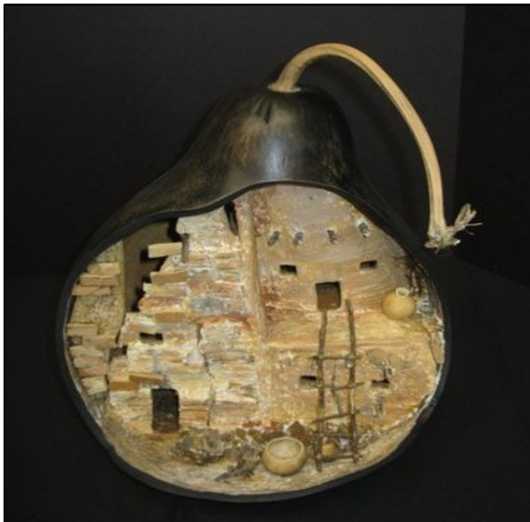
Category 7: Landscape — Don Rideau "People's Choice"