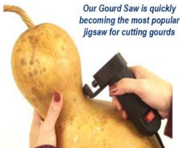
Our Gourd Saw is quickly becoming the most popular jigsaw for cutting gourds

Featuring the only power tools designed expressly for gourds!