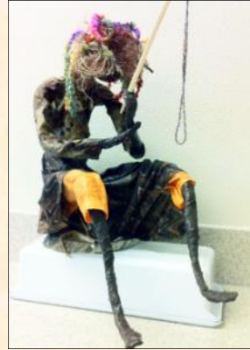
BETSY ROBERTS POWERTEX AND GOURDS