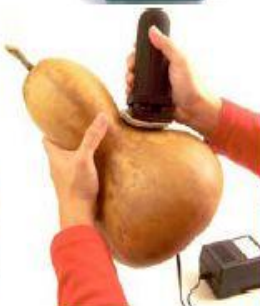
Our miniature power tools fit comfortably in your hand