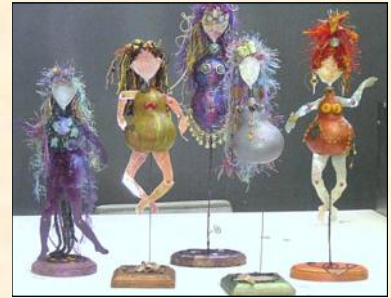
BETSY KRITZON DIVA DOLLS