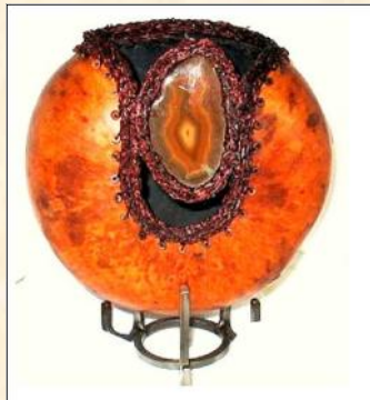
SUE BROGDON FOCUS ON AGATES