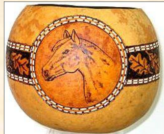
JILL WALKER LEATHER TOOLING