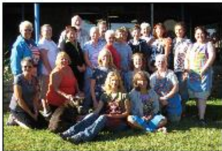
"Artzy Gurlz" first mixed media retreat, August, 2011

EACH SESSION IS: 3 FULL DAYS/4 NIGHTS LODGING AND 3 MEALS PER DAY. ALL MATERIALS INCLUDED.