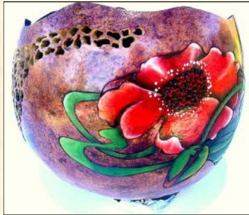
MARDELLA IVERS GLORIOUS POPPY WITH FILIGREE