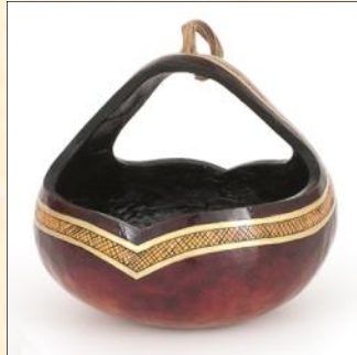
JELENA CLAY PALM BASKET WITH GOURD EMBELLISHMENT