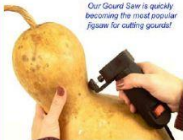
Our Gourd Saw is quickly becoming the most popular jigsaw for cutting gourds!