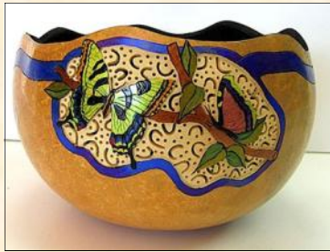
JILL WALKER BUTTERFLIES IN LACE WITH SILKS