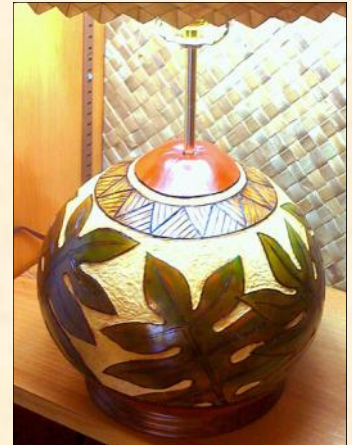
JELENA CLAY GOURD LAMP