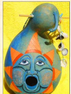
MARDELLA IVERS STAR GAZER'S BIRDHOUSE